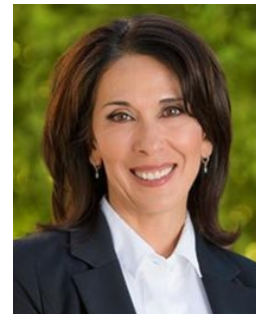
Executive Vice President and University Provost