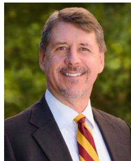
Executive Vice President, Treasurer and Chief Financial Officer