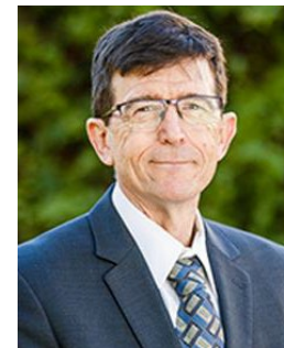
Vice President for Research and Chief Science and Technology Officer