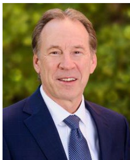
Senior Vice President of Educational Outreach and Student Services