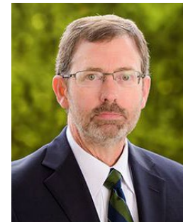
Senior Vice President and Chief of Staff