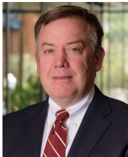
President of Arizona State University