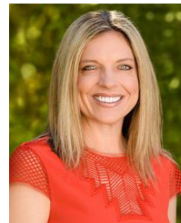
Vice President of Student Services