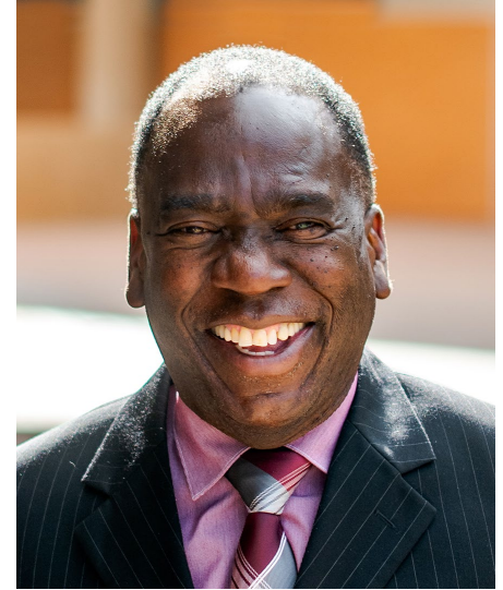
Professor of Statistics & Biostatistics, Department of Economics