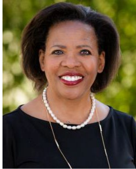
Vice President of Cultural Affairs, Executive Director of ASU Gammage